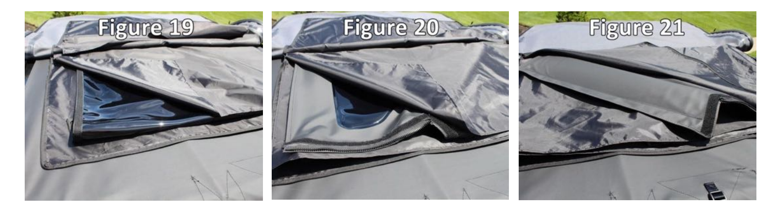
While every attempt is made to ensure that the information contained in these instructions is correct, no liability can be accepted by the authors for loss, damage, or injury caused by any errors in, or omissions from the information given. All service should be performed by qualified mechanics. Crown Automotive Sales Co., Inc. cannot be held responsible for any mechanical work performed. Standard and accepted safety precautions should be used in every procedure.