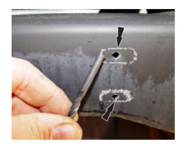
Warning: Use caution while drilling through the crossmember as the fuel tank is located directly behind it.

3. Drill holes into rear crossmember using a 3/16" drill bit and enlarge the holes with a 1/2" drill bit.