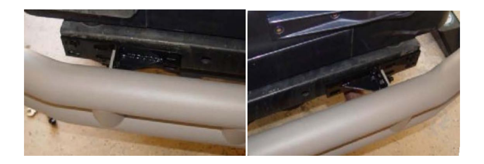
Warning: It is recommended not to exceed any tongue weight in excess of 200 lbs.