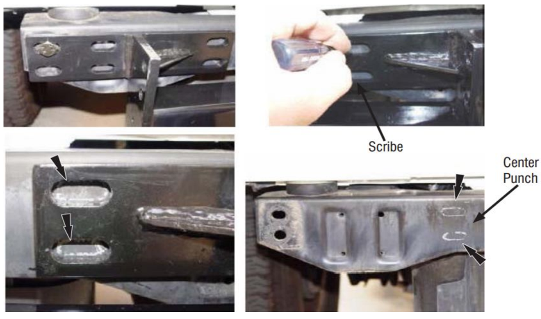
Page 1 of 3

Locate the Bumper Brackets. Place left bracket with large vertical tab facing outwards, toward the inside of the vehicle. Hold the bracket into place and, with a scribe or marker, mark the inner hole drilling point by marking through the Bumper Bracket onto the crossmember. Center punch the center of hole. Repeat for the other side.